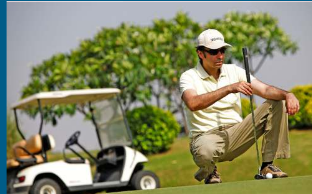
Chart on a course that sets your pulse racing.